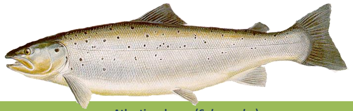
Atlantic salmon ( Salmo salar )